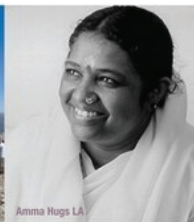
Amma Hugs LA