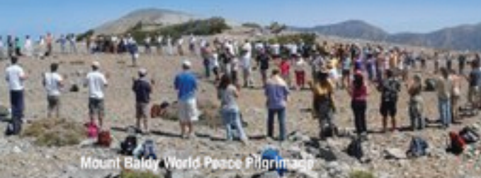
Mount Baldy World Peace Pilgrimage